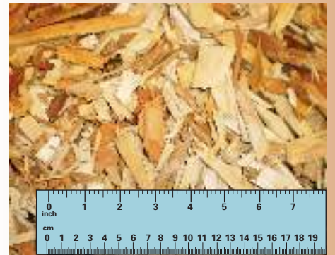
Figure 2. Woodchips commonly used in woodchip bioreactors