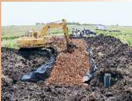
Figure 5. Filling an excavation with woodchips for a bioreactor installation

Providing these denitrifiers an ample supply of carbon to eat and giving them anaerobic conditions in the bioreactor offers them a perfect environment to remove nitrate from drainage.