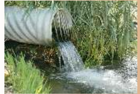
Figure 1. Subsurface tile drain outlet

A woodchip bioreactor is made by routing drainage water through a buried trench filled with woodchips. Woodchip bioreactors also are known as denitrification bioreactors, a name that is slightly more descriptive of the actual process occurring inside the bioreactor. Denitrification is the conversion of nitrate ( \text{NO}_3^- ) to nitrogen gas ( \text{N}_2 ) that is carried out by bacteria living in soils all over the world and also in the bioreactor. These good bacteria, called denitrifiers, use the carbon in the woodchips as their food and use the nitrate as part of their respiration process. Because these bacteria also can breathe oxygen, providing anaerobic conditions through more constantly flowing tile water helps ensure that the bacteria utilize the nitrate.