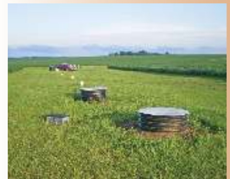
Figure 7. Woodchip bioreactor after installation; circular sumps and PVC wells used for research monitoring (Northeast Iowa Research and Demonstration Farm)