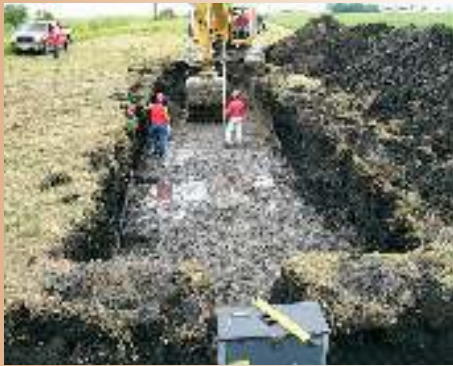
Figure 4. Excavation for a bioreactor installation