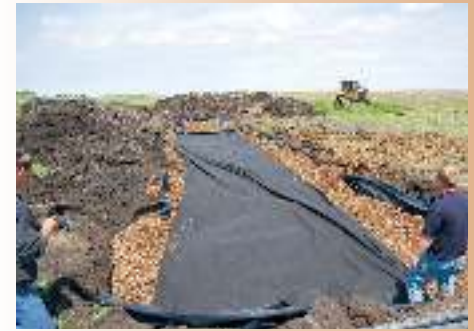
Figure 6. Covering the woodchips with a geo-textile fabric before laying the soil cover at a bioreactor installation

A bioreactor's annual nitrate load reduction can range from about 10 percent to greater than 90 percent depending on the bioreactor, the drainage system, and the weather patterns for a given year. Based on research from Iowa, Illinois, and Minnesota, most bioreactors show performance of about 15 to 60 percent nitrate load removed per year. It may be best to target fields or watersheds that have higher nitrate loads in order to have the biggest impact.